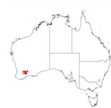
Acacia chrysopoda occurrence map. Occurrence map generated via Atlas of Living Australia ( https://www.ala.org.au ).