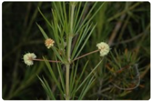
Source: Australian Plant Image Index (dig.6031). ANBG © M. Fagg, 2008