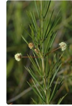
Source: Australian Plant Image Index (dig.6032). ANBG © M. Fagg, 2008