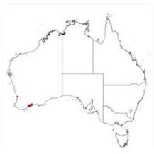
Acacia cedroides occurrence map. Occurrence map generated via Atlas of Living Australia ( https://www.ala.org.au ).