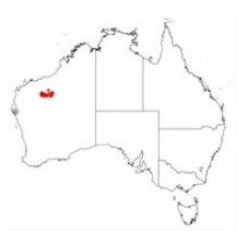
Acacia catenulata subsp. occidentalis occurrence map. Occurrence map generated via Atlas of Living Australia ( https://www.ala.org.au ).