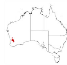
Acacia campylophylla occurrence map. Occurrence map generated via Atlas of Living Australia ( https://www.ala.org.au ).