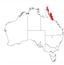
Acacia calyculata occurrence map. Occurrence map generated via Atlas of Living Australia ( https://www.ala.org.au ).