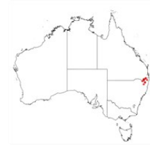
Acacia brunioides subsp. granitica occurrence map. Occurrence map generated via Atlas of Living Australia ( https://www.ala.org.au ).