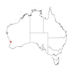
Acacia browniana var. glaucescens occurrence map. Occurrence map generated via Atlas of Living Australia ( https://www.ala.org.au ).