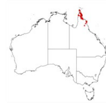
Acacia brassii occurrence map. Occurrence map generated via Atlas of Living Australia ( https://www.ala.org.au ).