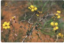
Source: WorldWideWattle ver. 2. Published at: www.worldwidewattle.com B.R. Maslin