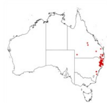
Acacia blakei subsp. diphylla occurrence map. Occurrence map generated via Atlas of Living Australia ( https://www.ala.org.au ).