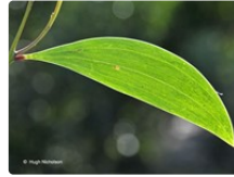
Source: WorldWideWattle ver. 2. Published at: www.worldwidewattle.com Hugh Nicholson