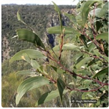
Source: WorldWideWattle ver. 2. Published at: www.worldwidewattle.com Hugh Nicholson