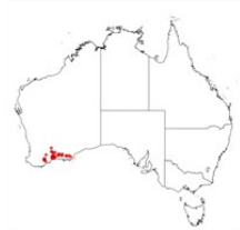
Acacia binata occurrence map. Occurrence map generated via Atlas of Living Australia ( https://www.ala.org.au ).