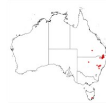
Acacia betchei occurrence map. Occurrence map generated via Atlas of Living Australia ( https://www.ala.org.au ).