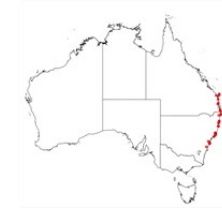
Acacia baueri subsp. baueri occurrence map. Occurrence map generated via Atlas of Living Australia ( https://www.ala.org.au ).