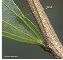
Source: WorldWideWattle ver. 2. Published at: www.worldwidewattle.com Hugh Nicholson