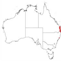
Acacia bakeri occurrence map. Occurrence map generated via Atlas of Living Australia ( https://www.ala.org.au ).