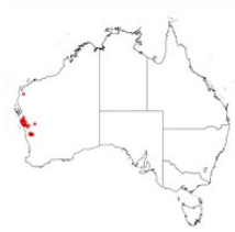
Acacia ashbyae occurrence map. Occurrence map generated via Atlas of Living Australia ( https://www.ala.org.au ).