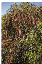
Source: WorldWideWattle ver. 2. Published at: www.worldwidewattle.com B.R. Maslin