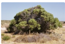
Source: WorldWideWattle ver. 2. Published at: www.worldwidewattle.com B.R. Maslin