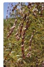
Source: WorldWideWattle ver. 2. Published at: www.worldwidewattle.com B.R. Maslin