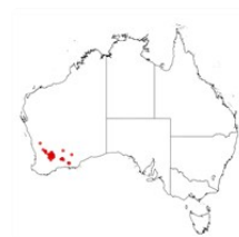
acoma occurrence map. Occurrence map generated via Atlas of Living Australia ( https://www.ala.org.au ).